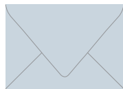
COOL BLUE (19, 9, 7, 1) CMYK Only