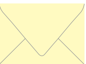
SORBET YELLOW (0, 0, 30, 0) CMYK Only