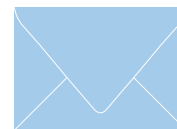
AZURE (23, 10, 0, 0) CMYK Only