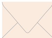
BLUSH (0, 7, 10, 1) CMYK Only