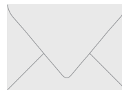
PALE GREY (8, 6, 6, 0) CMYK Only