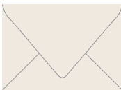
MIST (8, 9, 12, 0) CMYK Only