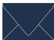
IMPERIAL BLUE (90, 78, 46, 39) White Ink Only