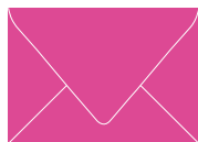
FUCHSIA (8, 86, 5, 0) CMYK or White Ink