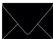
EBONY (70, 50, 20, 100) White Ink Only

The CMYK color builds provided below have been tested on our presses to produce the closest match for color envelopes. Please note the color builds are best used as a complementary color in your designs and will not produce exact matches. Since envelopes are dyed, printing a perfect color match is not possible. Large full coverage areas printed with CMYK builds to mimic the envelope color are not recommended.