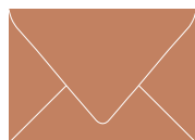
TERRACOTTA (5, 45, 55, 20) CMYK or White Ink