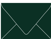
RACING GREEN (90, 60, 80, 60) White Ink Only