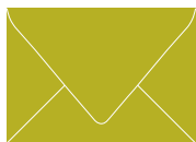
CHARTREUSE (5, 0, 90, 30) CMYK or White Ink