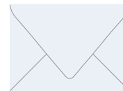
COOL GREY (7, 3, 2, 0) CMYK Only