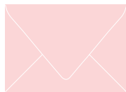
CANDY PINK (0, 19, 8, 0) CMYK Only