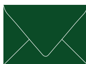
FOREST GREEN (96, 45, 100, 43) CMYK or White Ink