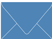
NEW BLUE (63, 30, 0, 16) CMYK or White Ink