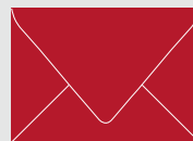
VERMILLION (9, 99, 84, 20) CMYK or White Ink