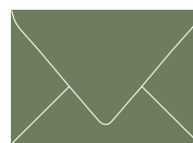
MID GREEN (60, 40, 70, 10) CMYK or White Ink