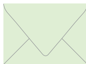
PISTACHIO (12, 0, 20, 0) CMYK Only